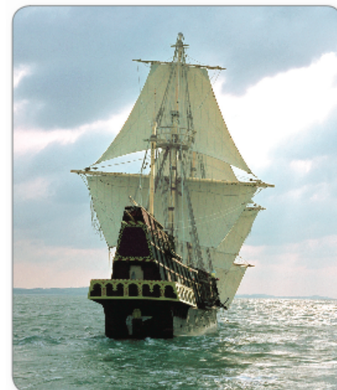
Wooden sailing ships transported goods across the Atlantic Ocean.